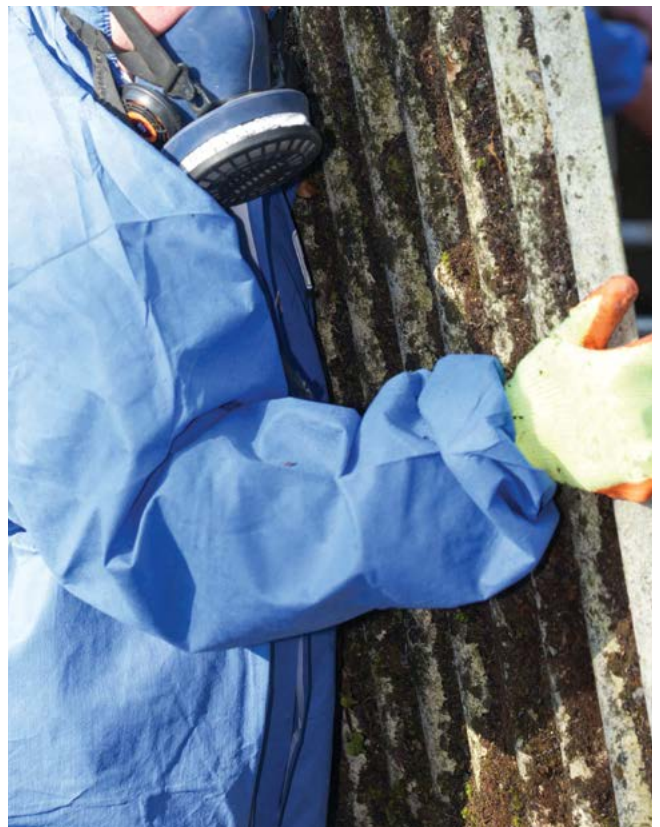
Wear protective clothing when renovating.

PPE is commercially available at construction suppliers, safety equipment retailers and some hardware chains.